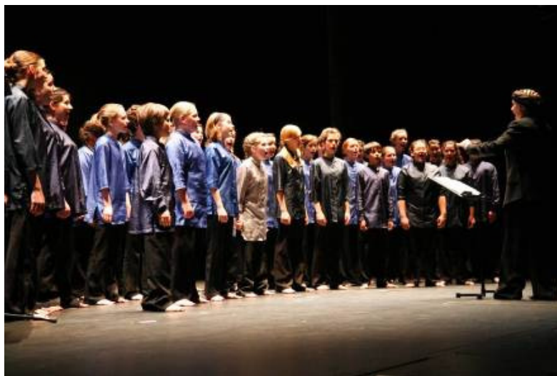
Sydney Children's Choir performing at the Australian Music Centre – APRA 2006 Classical Music Awards

The Senior Choir is the Sydney Children's Choir's main performing choir, and as such has a very strong reputation, both in Australia and overseas, for being a choir of exceptional standards, which performs interesting and demanding repertoire. Such a reputation is gained and maintained through the work and dedication of the choristers. As well as attending weekly rehearsals, choristers must attend a three-year sight-singing course held on Saturday afternoons. It is exceptionally rare for new auditioning choristers to be directly offered a place in the Senior Choir.